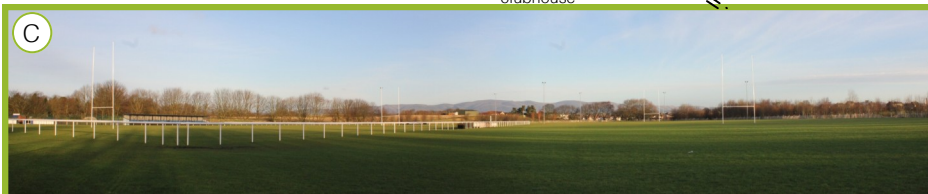
Main image: Site layout showing extents of new facilities Left image: Completed pitches and training area.