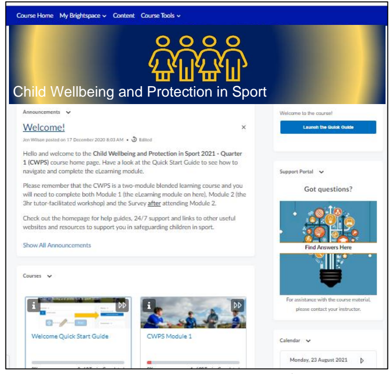
Course Homepage/Dashboard Screenshot

You are now ready to start the training, after you click on the Child Wellbeing and Protection in Sport Course your dashboard will look look something like this: