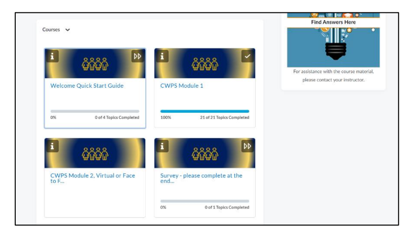
Course Modules Screenshot